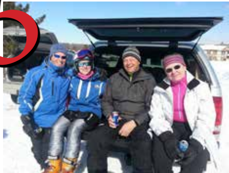
Plenty of time for tailgating