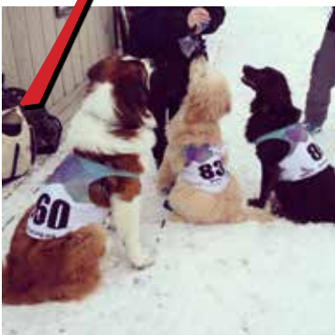
We are furry-friend friendly