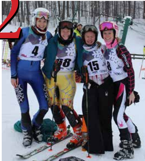
Race against your BFFs