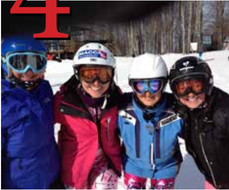
A great reason to smile