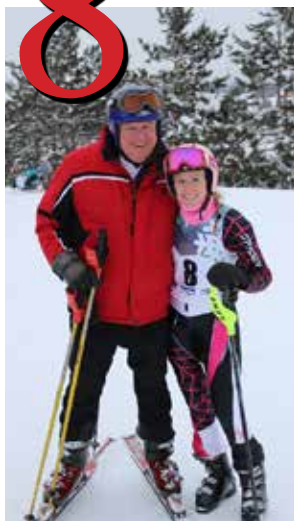
Families who race together, stay together