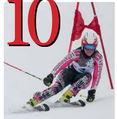
... and fast paces!